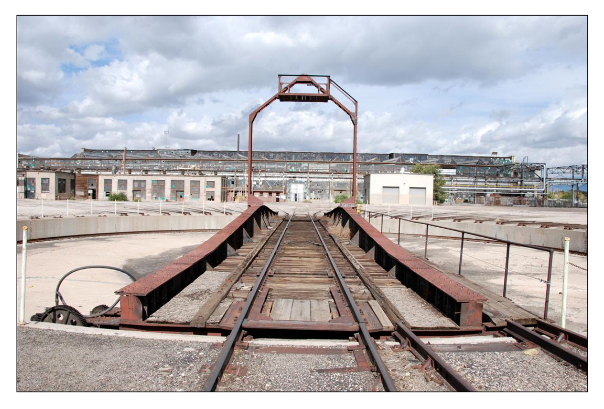
Figure 15 Working Rail Yards turntable with vacant Erecting/Machine Shop in the background

One of the significant components of The WHEELS Museum is the built from scratch exact replica of the demolished roundhouse located precisely where it stood with the working turntable as the center piece. While the roundhouse exterior would look as it did during the working era, the WHEELS Museum roundhouse would be constructed of all new material, as green as practical, and with a purpose partially fulfilling the need for steam and Diesel locomotive and car maintenance, but primarily as new space for exhibits, classrooms, etc. There are many benefits: