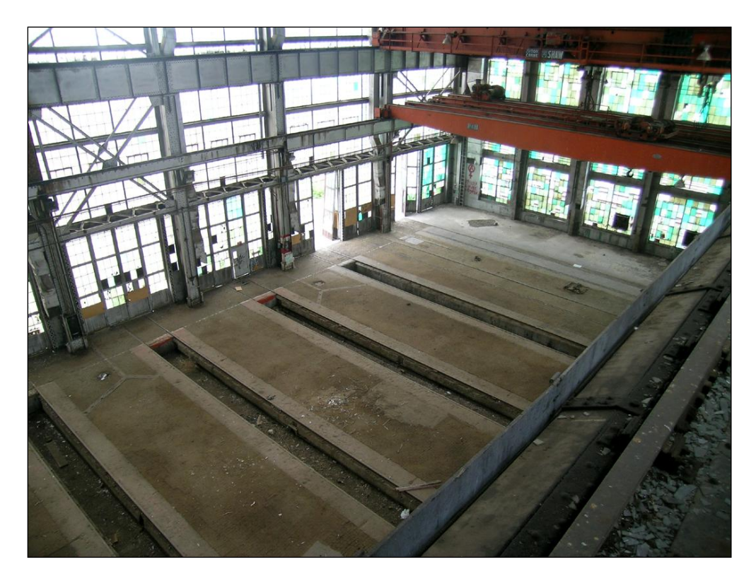
Figure 2 Vacant Erecting Shop Today – Note Intact 250 Ton Overhead Crane