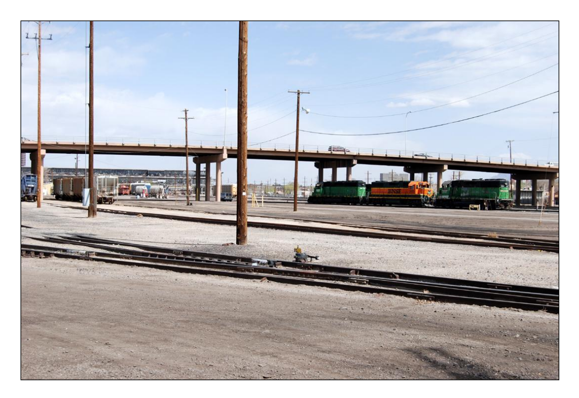
Figure 11 South Boundary of Rail Yards is BNSF Railway Property including Locomotive Storage and Switching