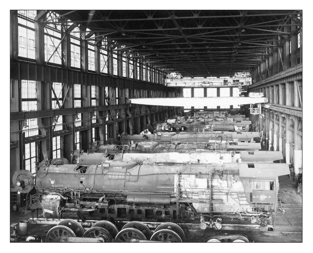
Figure 1 Steam Locomotives Undergoing Major Overhauls in Erecting Shop circa 1953

It has been the WHEELS' dream and vision to utilize all or a significant portion of the 27 acre site and its vacant historic large buildings for the purpose of creating a world-class transportation museum.