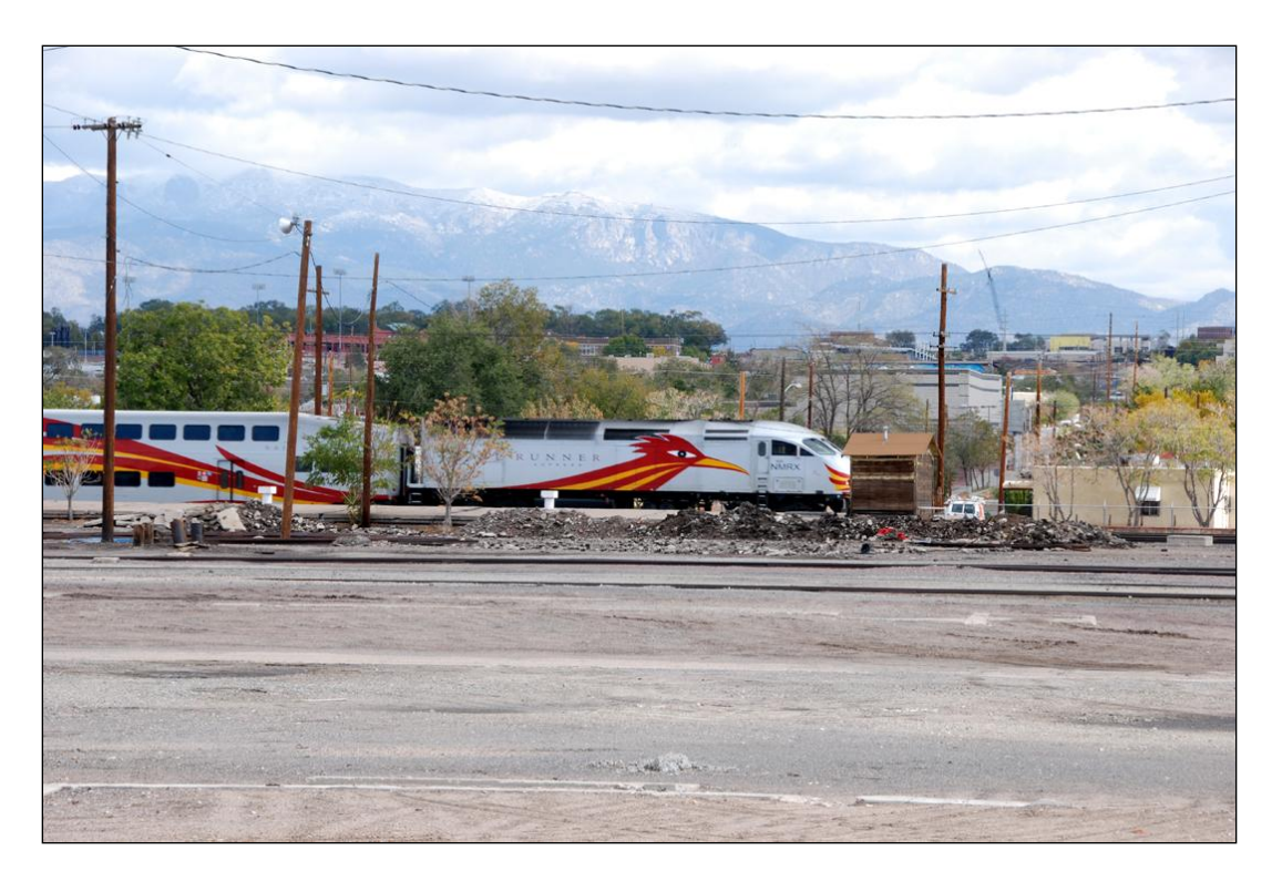
Figure 10 East Boundary of Rail Yards is also used by NM Rail Runner Express Commuter Trains