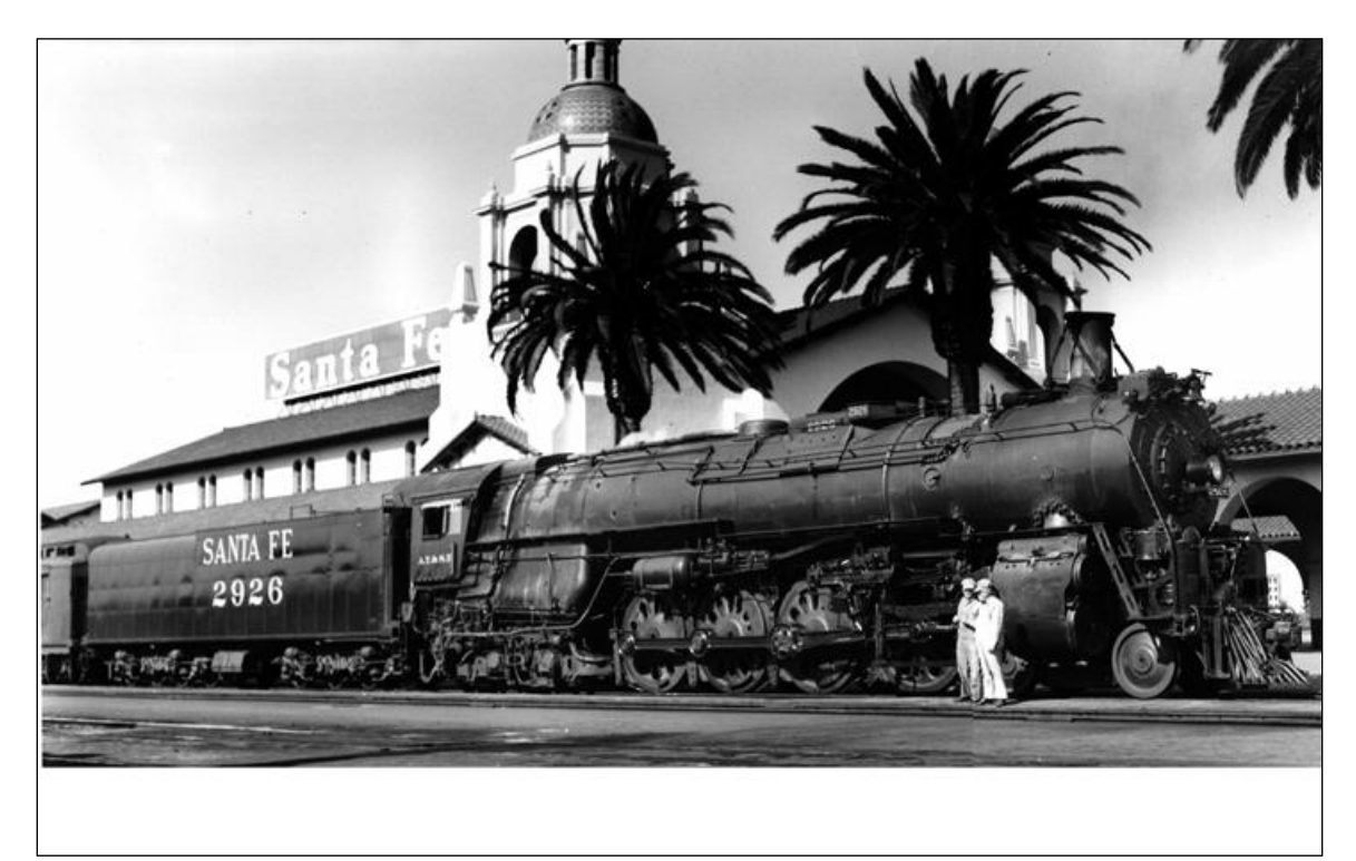
Figure 8 Santa Fe No. 2926 in San Diego in 1953 – Now Undergoing Restoration to Operating Condition and to be Based at WHEELS Museum

Steam locomotive ex-Santa Fe No. 2926 now undergoing restoration to operating status by the New Mexico Steam Locomotive & Railroad Historical Society will make the WHEELS Museum its home for display and operating base for regular passenger excursions. No. 2926 is over 120 feet long and weighs close to 1 million pounds. The size of No. 2926 is in keeping with other locomotives that will be on display and operation.