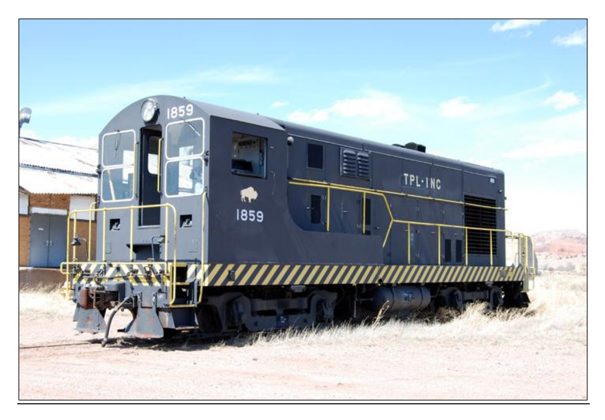
Figure 7 Donated Operating 1953 Fairbanks Morse 12-44 Diesel Switcher Locomotive Waiting for Shipment from Ft. Wingate, NM to WHEELS