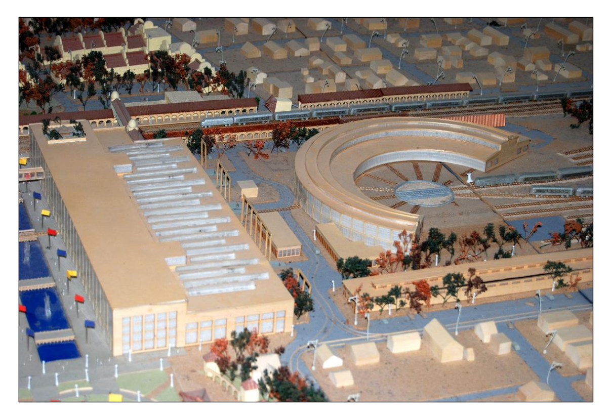
Figure 16 Model of Rebuilt Roundhouse as part of WHEELS Museum Credit VOA Architects