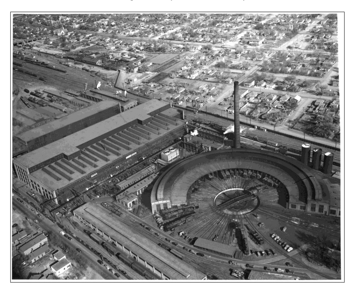
Figure 14 The Albuquerque Roundhouse during the peak era of steam locomotive maintenance. The roundhouse was demolished in 1986 but the turntable is still functional and in use by the BNSF Railway.

A critical component of every working rail yard during the age of steam locomotives was the roundhouse which was a structure designed around a turntable for spotting locomotives in stalls for routine maintenance. The rail yards in Albuquerque had a very large roundhouse which the Santa Fe Railway demolished in 1986. However, the turntable still exists and is in frequent use by the BNSF Railway.