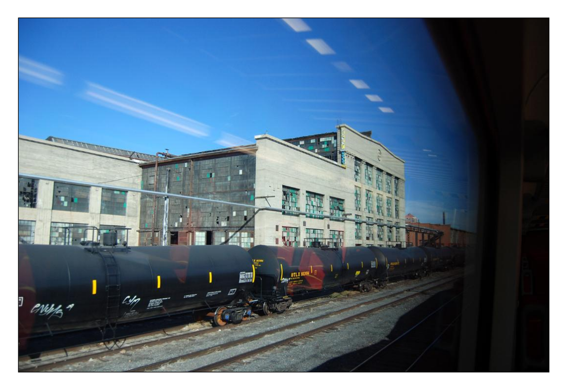
Figure 9 East Boundary of Rail Yards Consists of Active Tracks for BNSF Freight