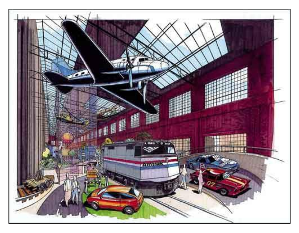
Figure 3 Artist's Concept with Major Displays in Erecting Shop Credit North Carolina Transportation Museum