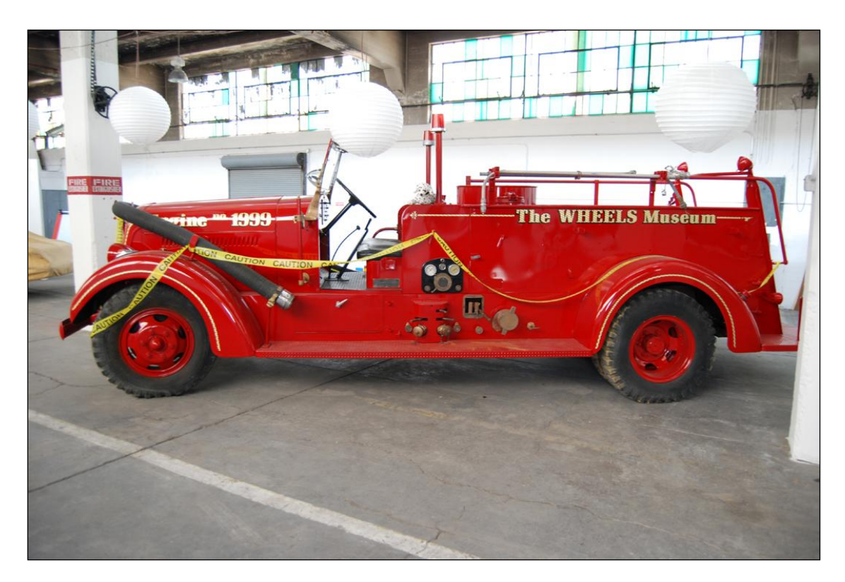
Figure 6 1942 Seagrave Fire Truck