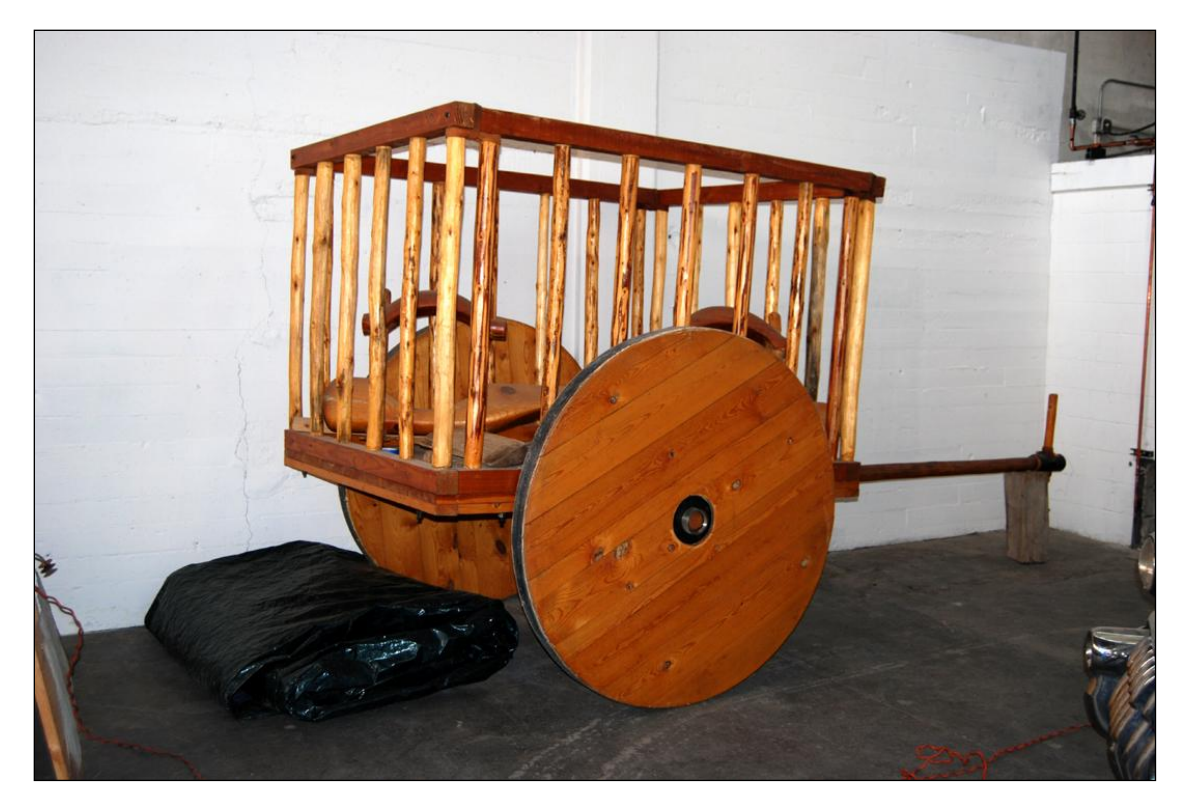
Figure 4 Replica Carreta (Ox Cart) Donated to WHEELS Representing the Earliest Form of Wheeled Transportation in New Mexico

The WHEELS Museum expects to receive significant artifact donations as space becomes available and restoration efforts proceed with artifacts ranging from historical locomotives to automobiles and to light aircraft. With the residency of the WHEELS Museum at the Rail Yards, the city of Albuquerque will experience tourism activities at all age levels and origins, with families, young and old, local, national and international tourists. The potential varied population visiting the site could spark immediate ancillary businesses in the vicinity. The WHEELS Museum itself will serve to embody historical innovations, including technologies, research and inventions that sprung forth from Albuquerque and New Mexico.