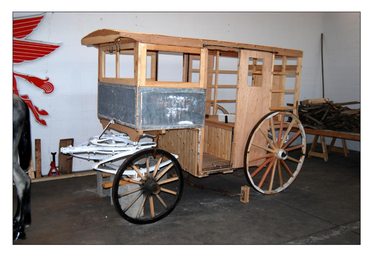
Figure 5 Horse Drawn Milk Delivery Wagon from Corrales, NM under Restoration